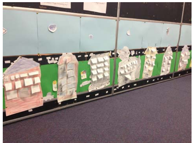
The Times Table City!