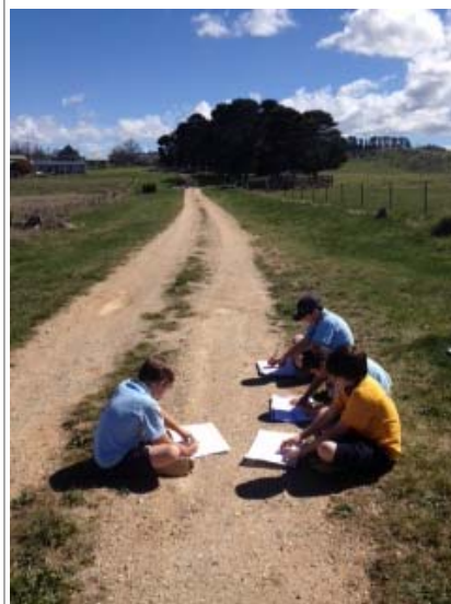
Outdoors drawing classes (when it was sunny and warm!)