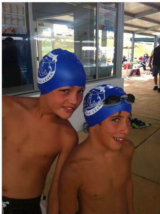
Our new swimming caps

The next P&C meeting will be 2 nd March.