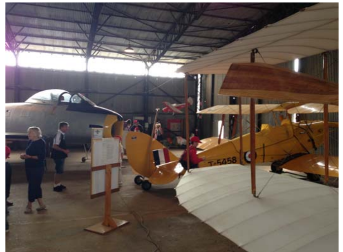
Narromine Aviation Museum