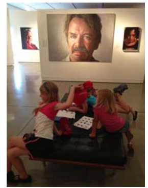
The Archibald Prize at the Western Plains Cultural Centre