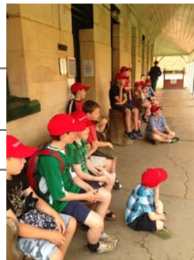
Old Dubbo Gaol