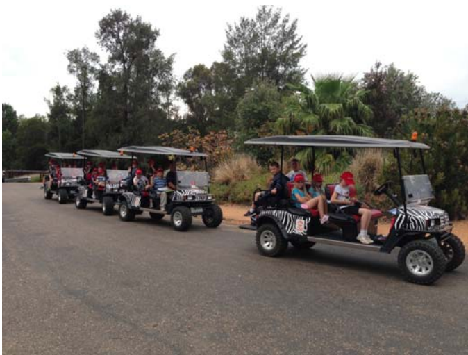
Our convoy of buggies at Dubbo Zoo