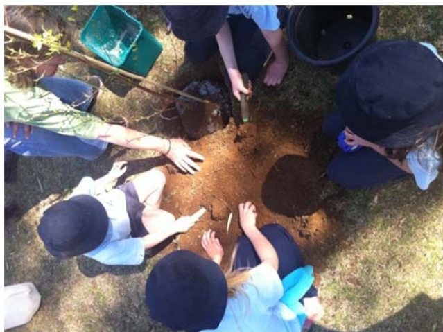
Lots of helpers to plant the Silver Birch