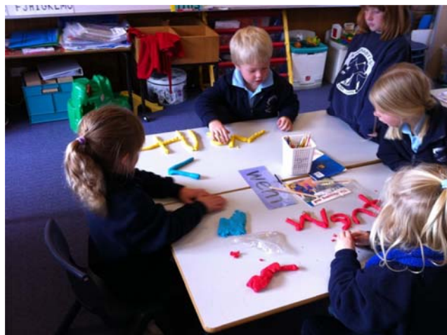
Kindergarten – play dough writing.